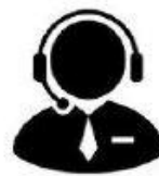
Customer Centric Team We have your back