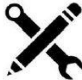
Customized Holidays Customized Experience