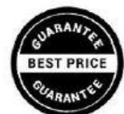
Best Price Guarantee Peace of Mind