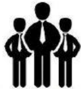
Travel professionals Save you time and money

Total Price including Taxes: Starting from INR 44,100 per person