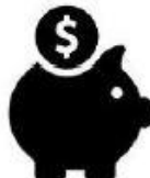
Easy Payments Easy on Pocket